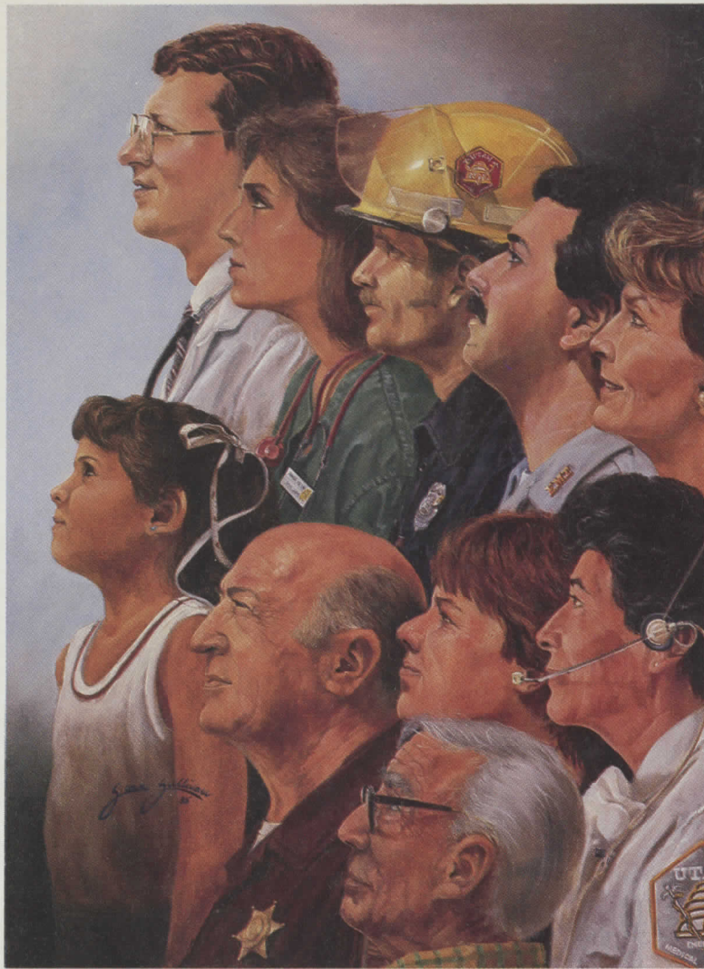
SERVING THOSE WHO CARE